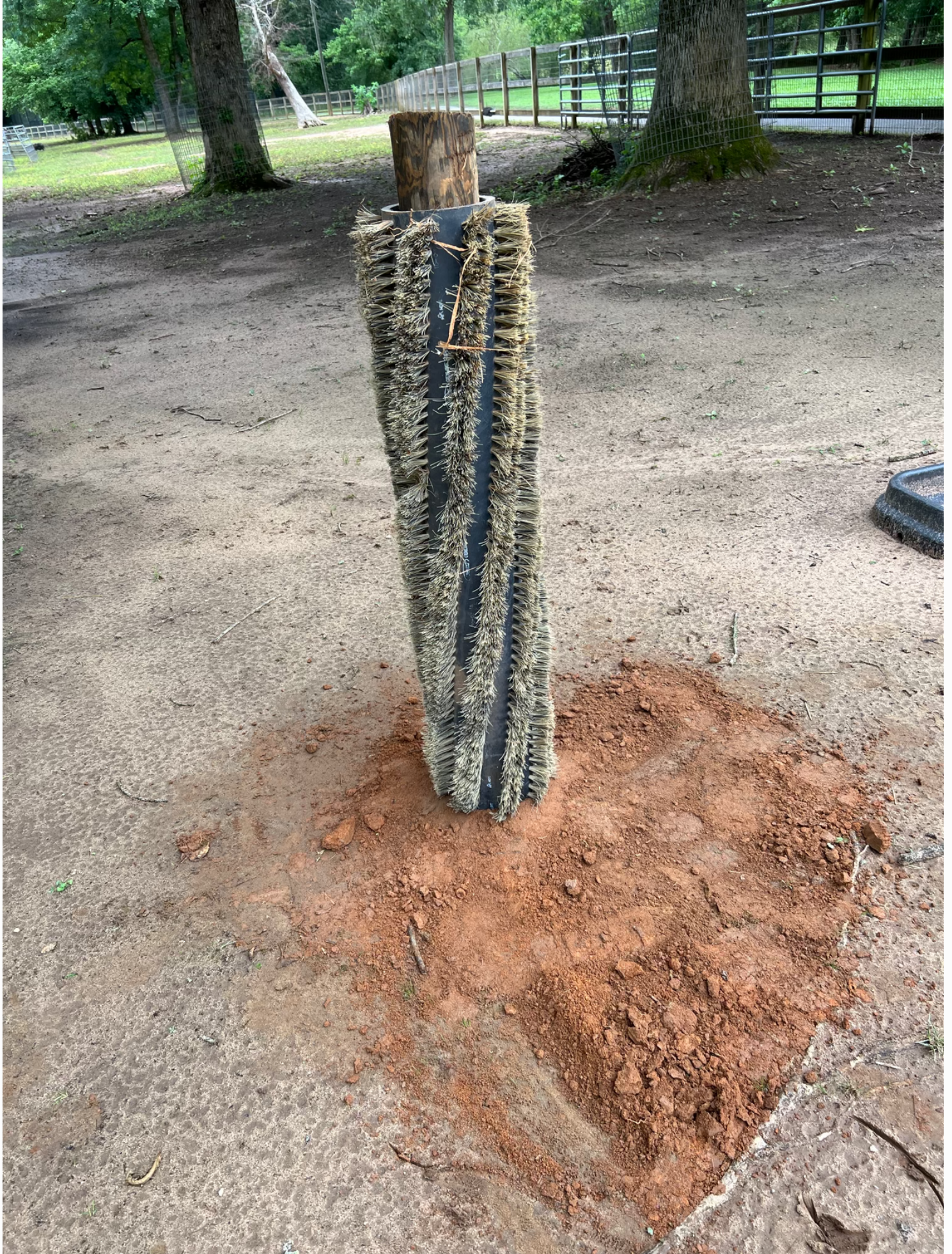
A new scratching post was installed for our Motley Crew! It's already a favorite.