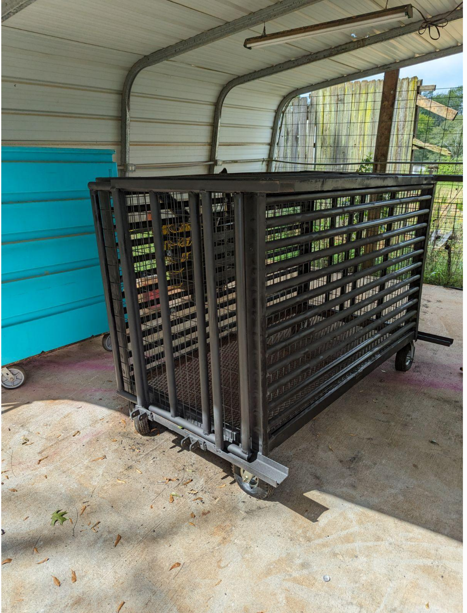
A robust transporter has been made in anticipation of upcoming habitat renovations.