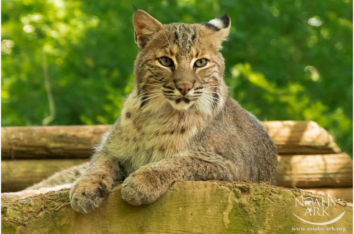
Baby Bob, our resident bobcat.

This shelter is not only naturalistic and attractive, but multi-functional as well. The new shelter will provide a larger basking/lounging area for our feline friend and lots of nooks to hide his favorite enrichment stimulating his hunting instincts.