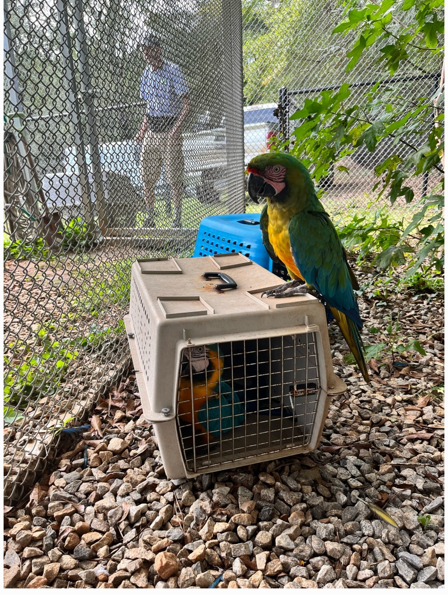
A bonded pair keeps a watchful eye on each other. Due to their protective nature, one parrot must be crated while its partner receives their well-check.