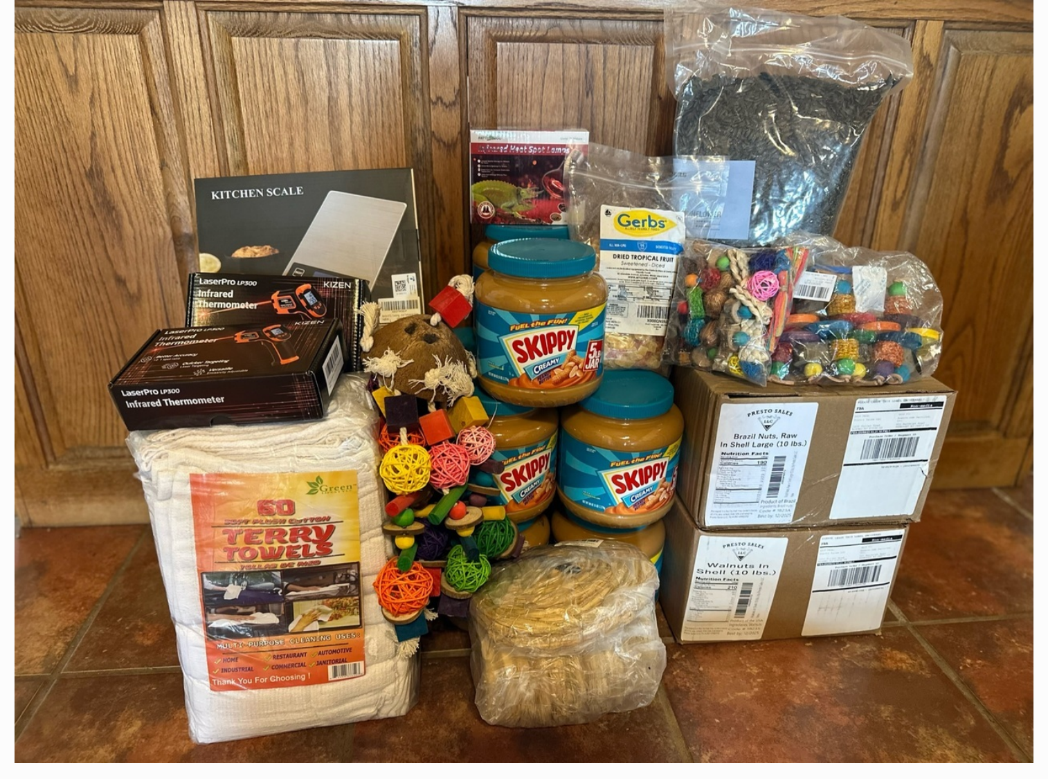
We are incredibly thankful to our donors who have purchased supplies, toys, food and more from our AMAZON Wishlist. These donations are critical to our daily operations, and make a big difference in offsetting our cash costs. Thank you!