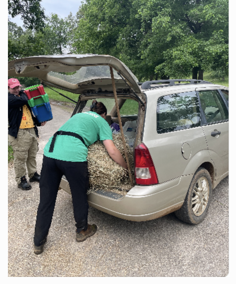
Our hard working Patti-Wagon, a 15 year-old Fort Focus, has been a treasured member of the team, even when sticks are used o prop up her ailing parts.