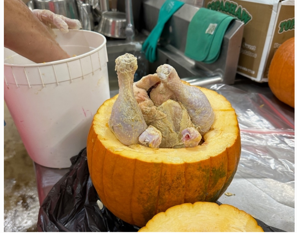
A delectable Autumn treat was prepared for our residents. . .Pumpkin Enrichment!! Chicken legs have been coated with vitamin and joint supplement powder, making it an even healthier treat.