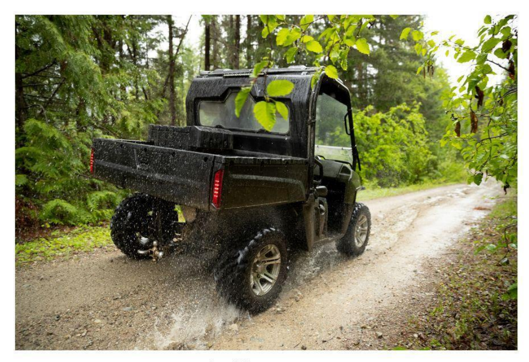
IN NEED OF