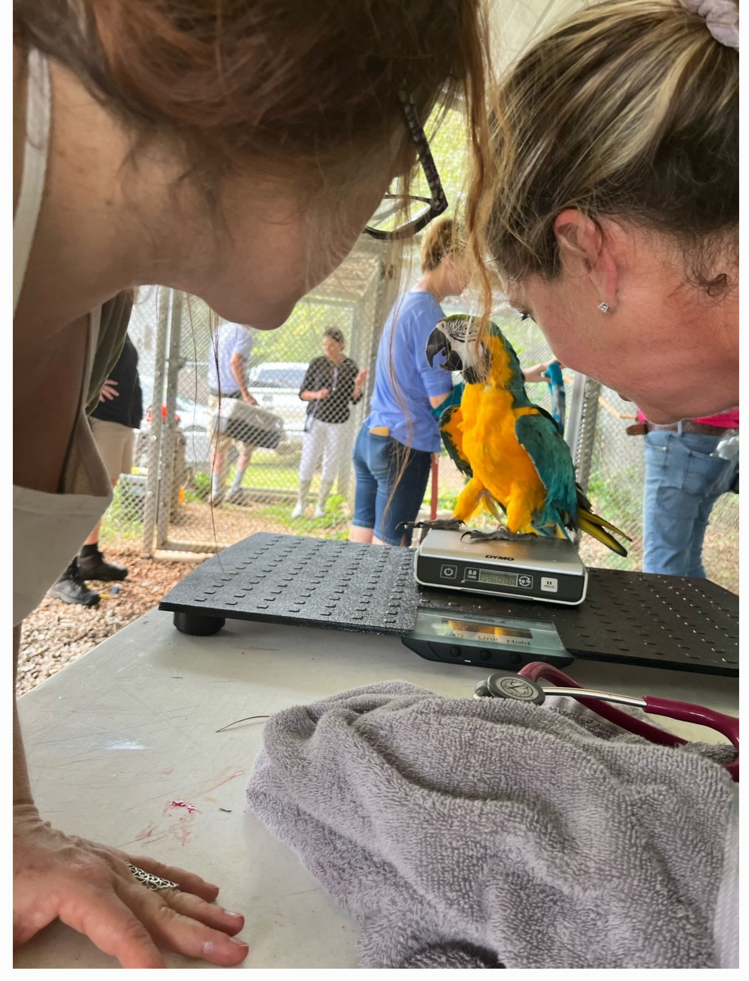
Each macaw is weighed, given a body condition exam, and a pedi/beaki. She didn't want to leave the scale!