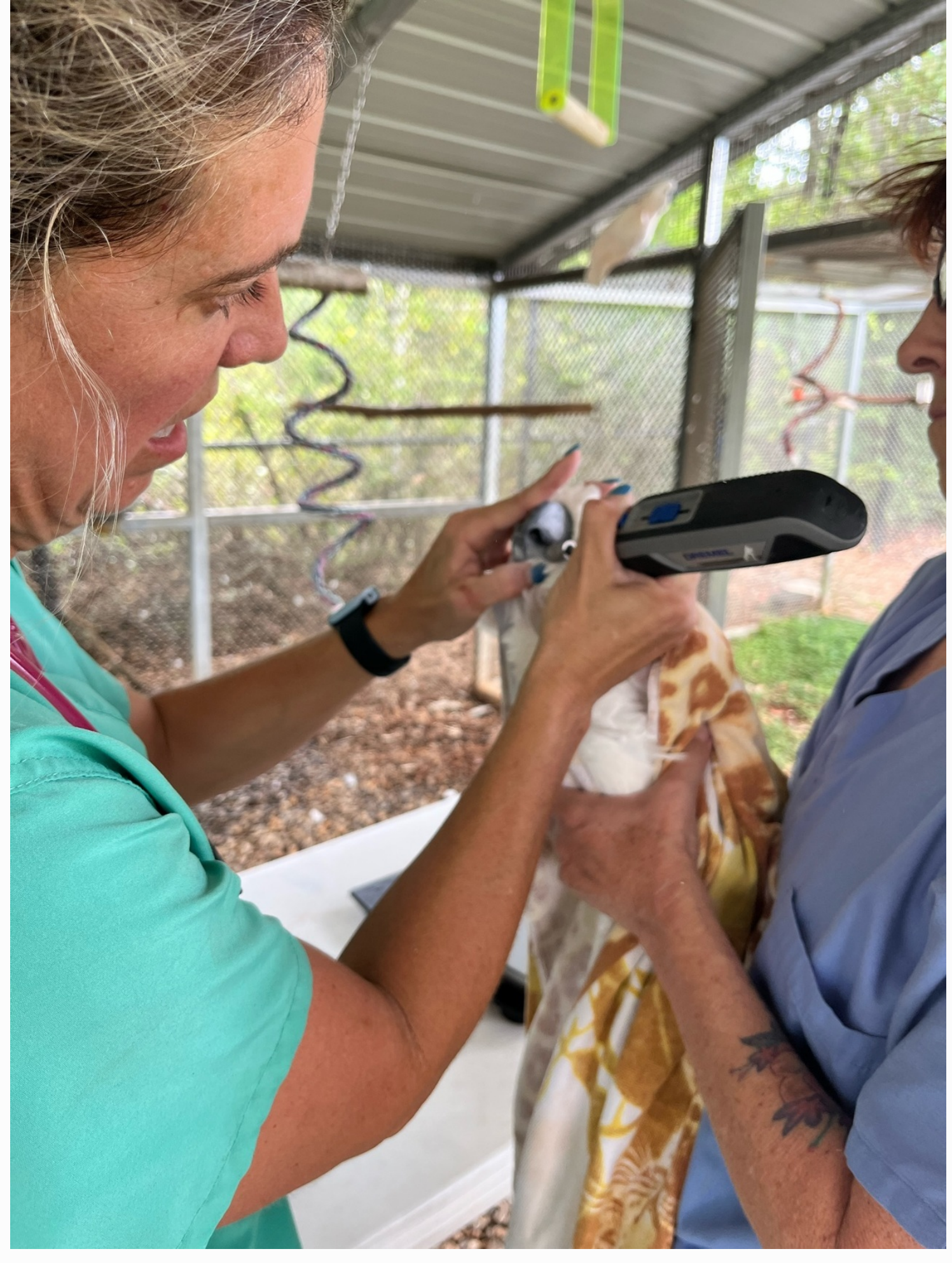
Even with lots of chew toys in their habitats, routine beak and nail trims are necessary to maintain a healthy flock.