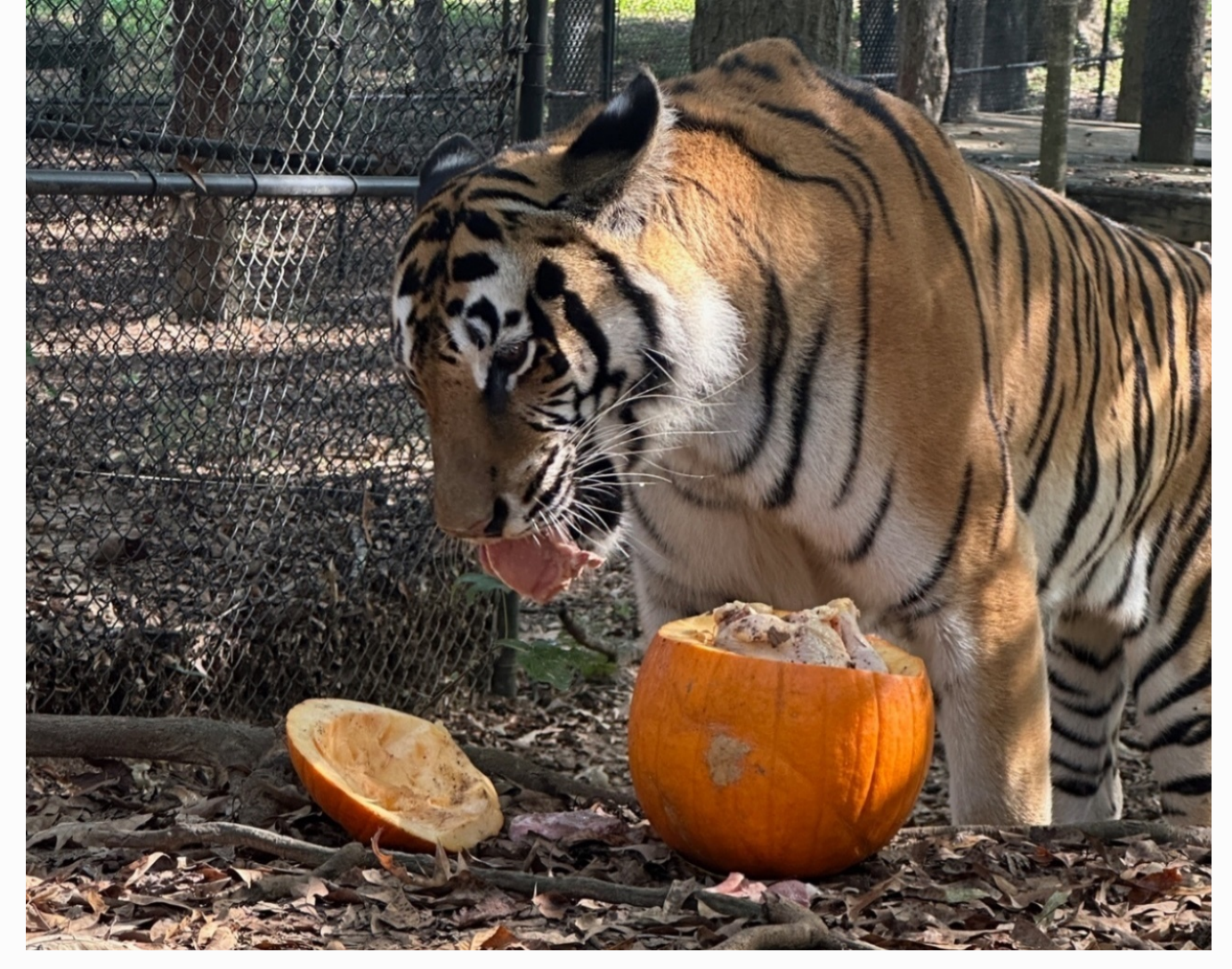
Gabby, one of our Bengal tigers enjoying some chicken tucked into her pumpkin.