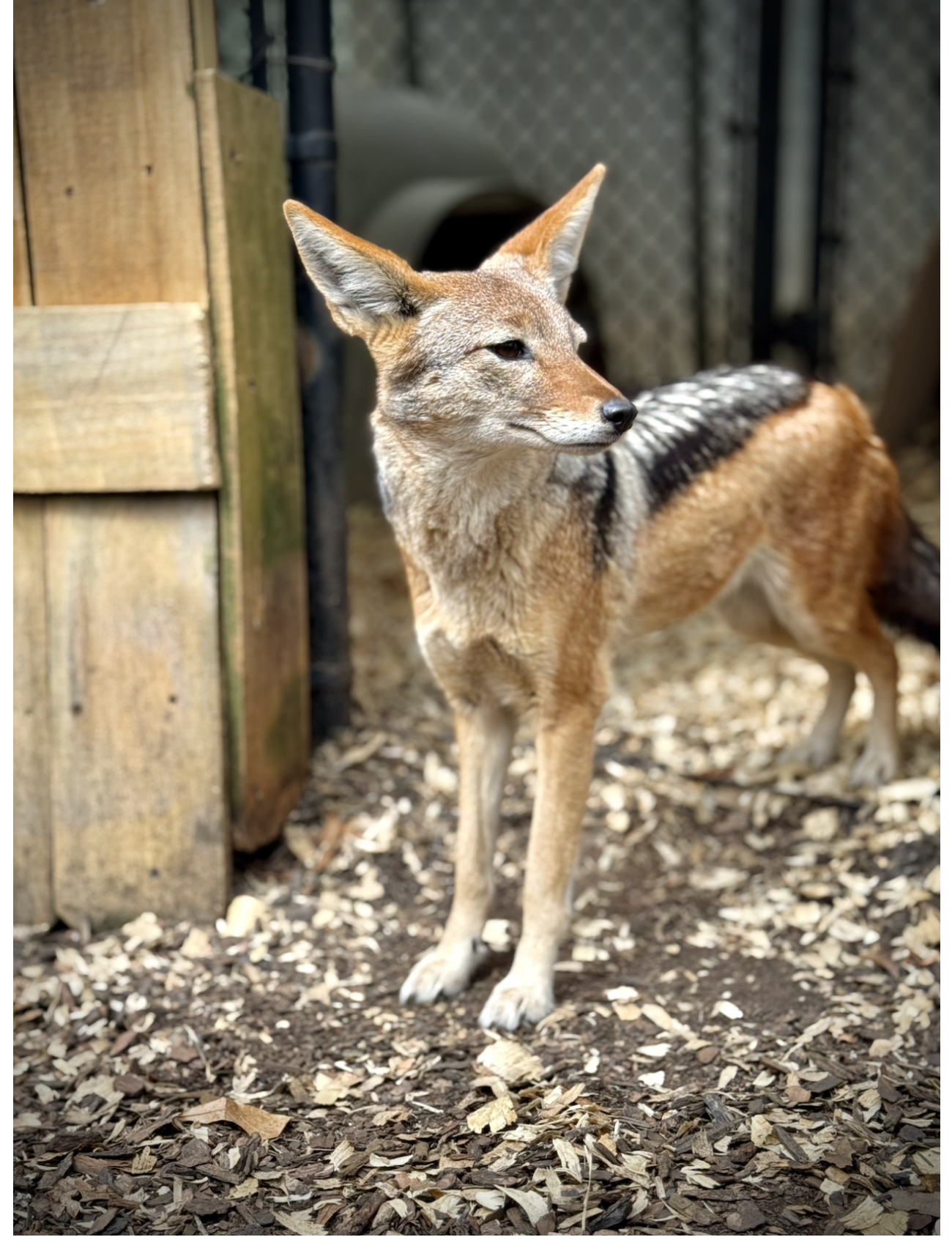
Our sweet, shy female

We are beyond excited to introduce our black-backed jackals , a rare and exciting addition to Noah's Ark! They came from the same organization that brought us our precious foxes— and we couldn't be more grateful!