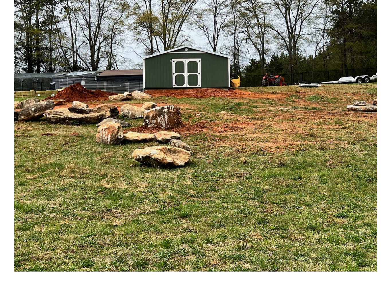
We're making great strides in completing Tortoise Bluff!

The habitat is coming together as we position rocks, set up their wintering barn, and shape their new space. We can't wait to see our tortoises enjoy their expansive, enriched environment.